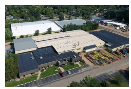
Stevens Point, WI