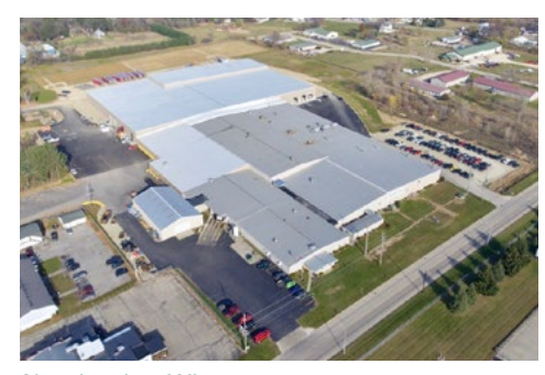
New London, WI